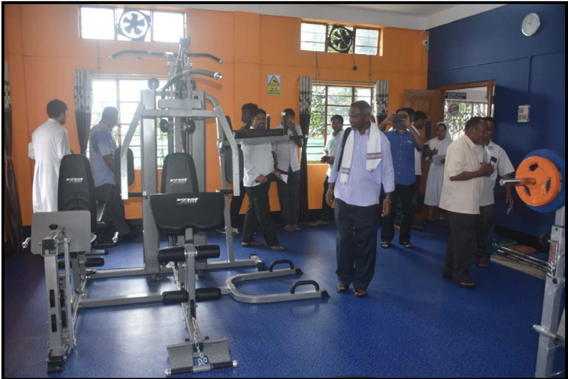
Photo 4: Fr. Anthony Buccieri Memorial Gymnasium in the college building.

in college building itself is to empower the students to improve their physical and mental well being.