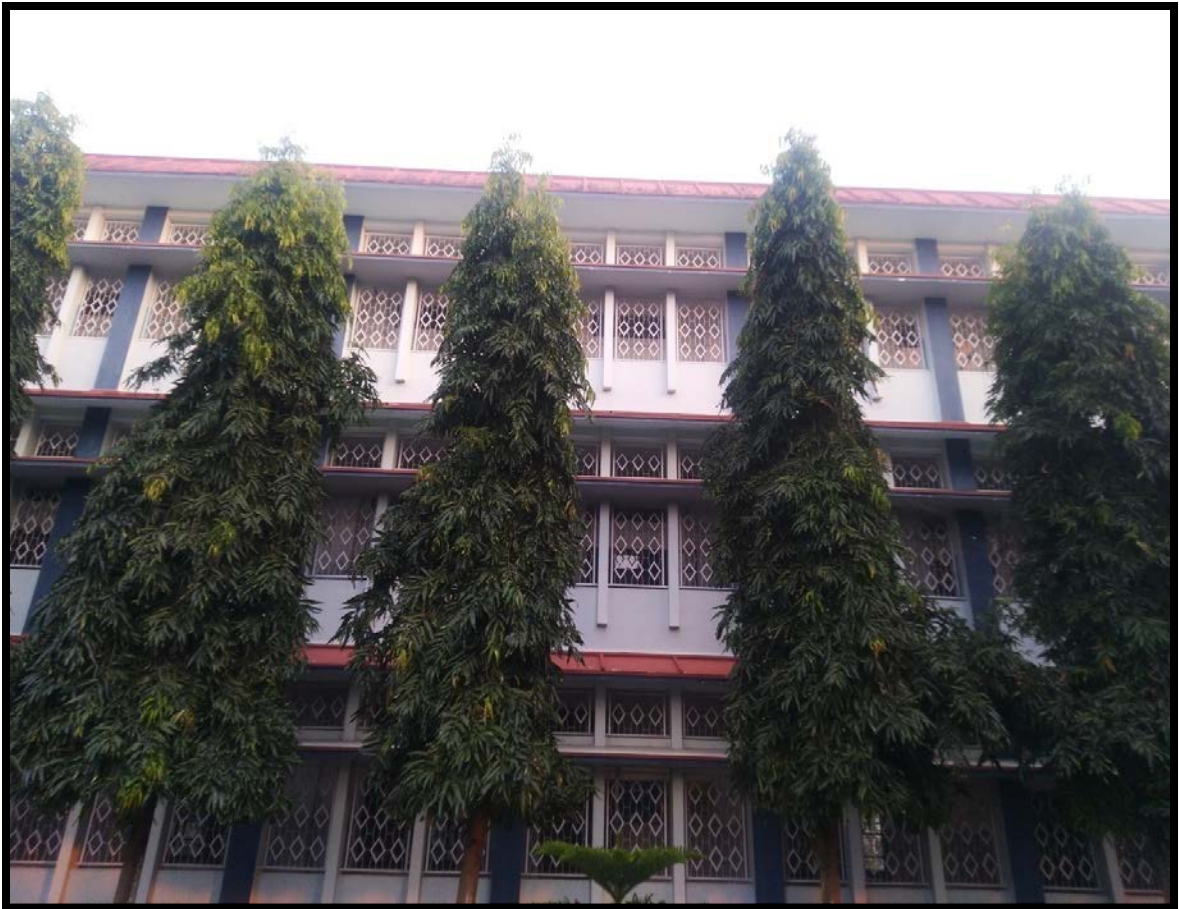
Photo 6: Strategic planting of trees in front of college building reduce building carbon emission