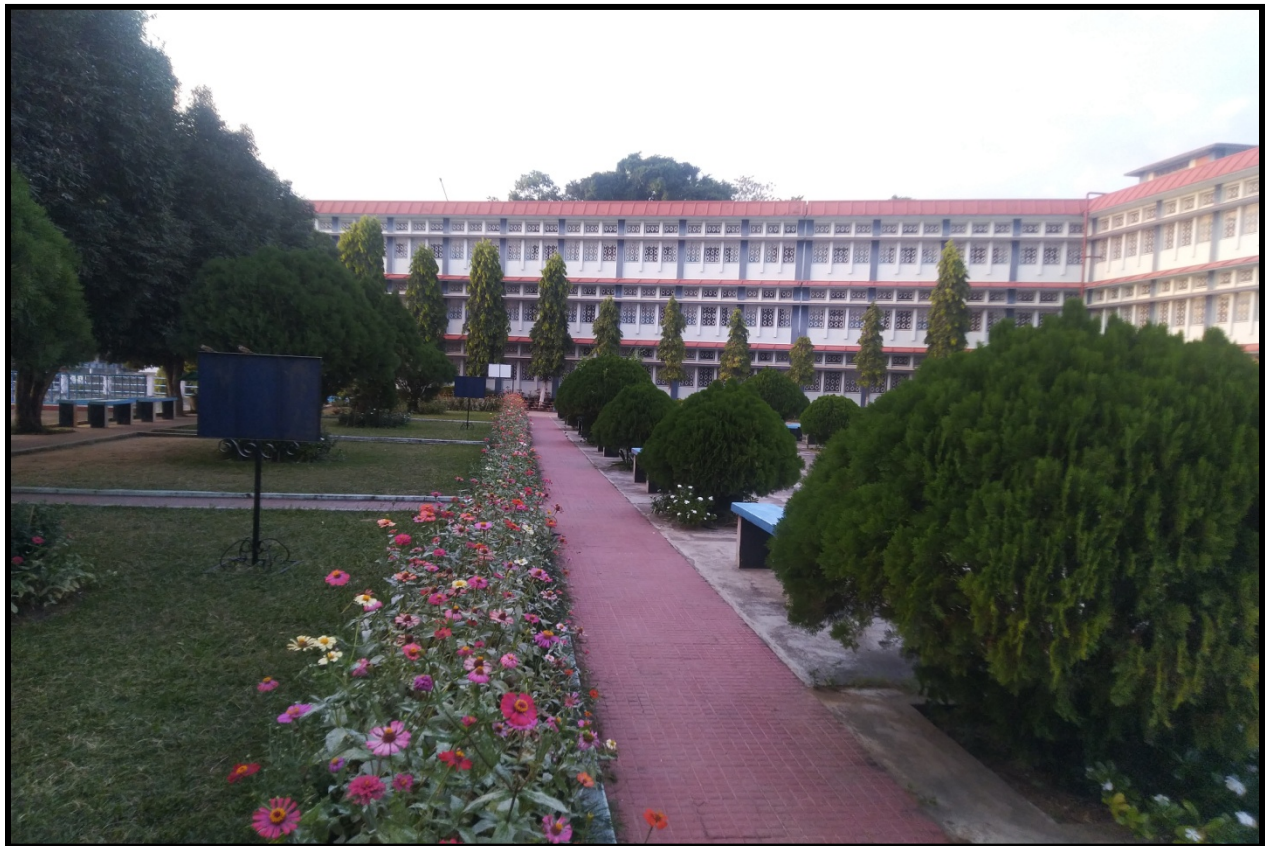
Photo1: Don Bosco College Building with lush green trees and seasonal flowers

Green Campus is a place where environmentally responsible practice and education go hand in hand. Green Campus serve as a laboratory of self scrutiny, experimentation and application where operational functions, academic programs and people are interlinked providing educational and practical value to the Institution, the region and the world as a whole. Don Bosco College, Tura keeps practicing and promoting a self sustainable green campus with a view to preserve and enhance the Institution in the future to come and always maintains beautiful seasonal flowers, shade trees, fruit trees and medicinal plants as well as endangered plants all throughout the year. The Institution adopted simple cost effective steps to reduce energy and water use and minimize the campus waste and established low cost environmentally friendly alternatives available. The College campus itself can be described as a self sustainable one in terms of environmental, ecological and economic point of view.