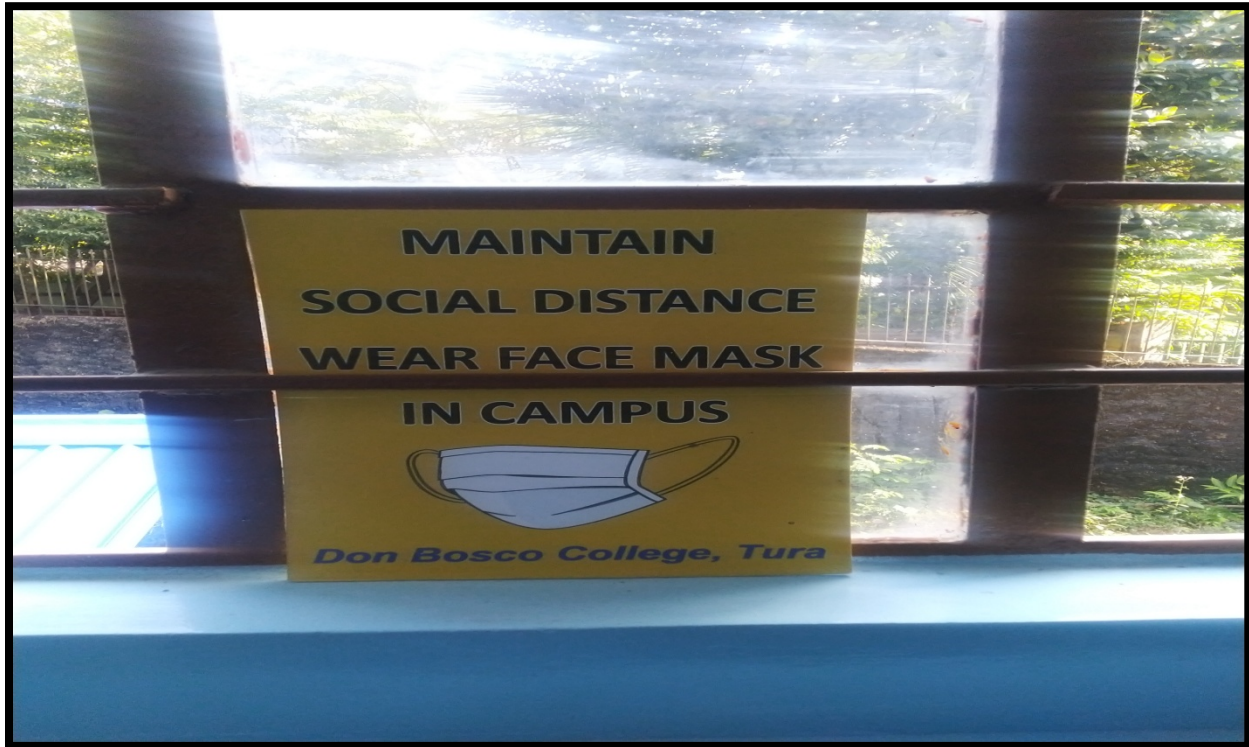
Photo 5: Signboard to maintain social distance and wearing of face mask in the campus