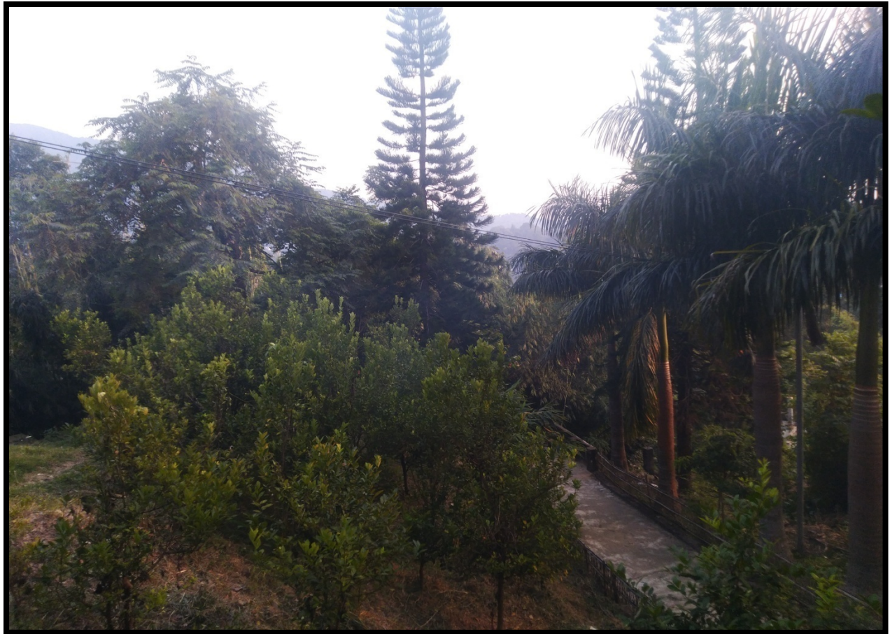
Photo 3: Endemic and endangered Citrus indica garden provides an overall greenery cover